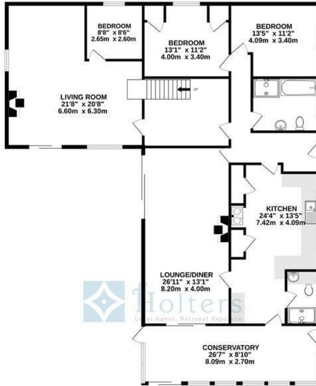
GROUND FLOOR 1957 sq.ft. (181.8 sq.m.) approx.